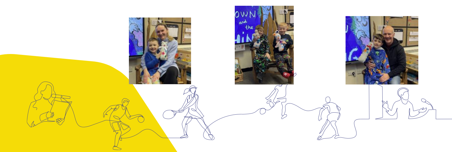
LEARNING TOGETHER TO ACHIEVE SUCCESS FOR ALL

Thank you to all the adults that came into school yesterday to make Cuddle Pets. All our Reception children loved making their Cuddle Pet with their grown-up and as you can see from the photos below, everyone had a fabulous time.